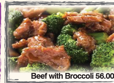
Beef with Broccoli 56.00