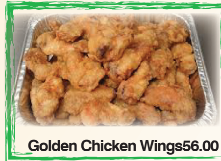
Golden Chicken Wings 56.00