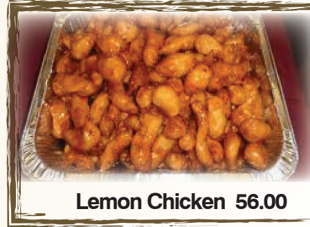
Lemon Chicken 56.00