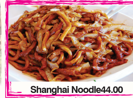
Shanghai Noodle 44.00