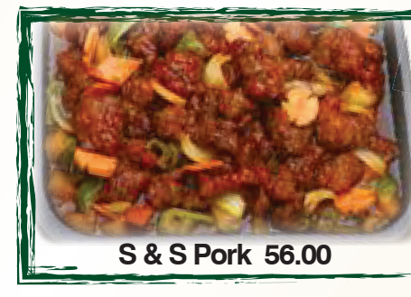
S & S Pork 56.00

All Pictures are Reference Only* If you have any allergies, please inform the server before ordering. *Prices are subject to Change without Notice.