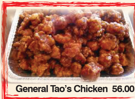
General Tao's Chicken 56.00

CATERING SERVICE Menu To Meet Every Taste And Budget