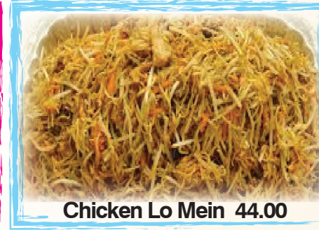
Chicken Lo Mein 44.00

10% OFF Discount on cash pick - up order over $25 or more (before Tax) ( Family Dinner and Single Combo Excluded )