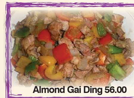
Almond Gai Ding 56.00

All Pictures are Reference Only* If you have any allergies, please inform the server before ordering. *Prices are subject to Change without Notice.